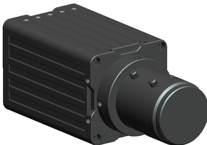
Figure 1 G46E35 infrared thermal imager movement renderings